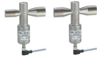
EX4 /EX5 / EX6